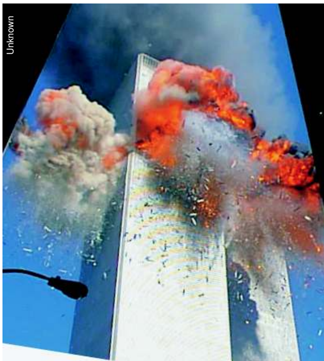
Figure 8-4 The actual attack