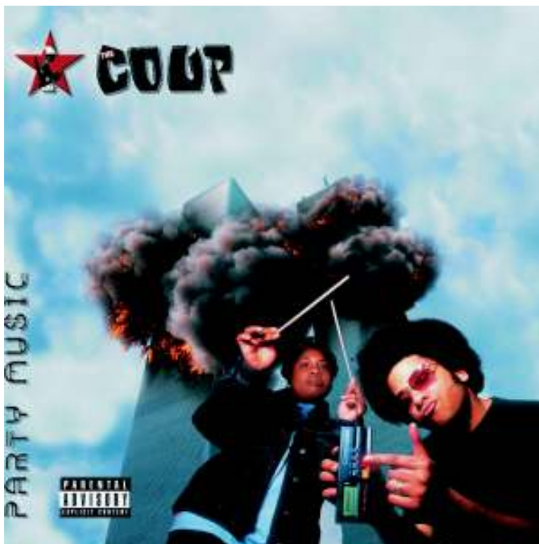
Figure 8-5 The July, 2001 artwork