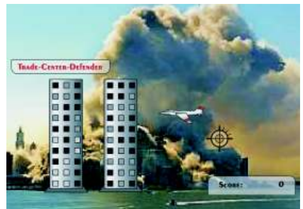
Figure 8-3 “Trade Center Defender” may be the worst game ever made. Who made it? And why?

July was also when artwork for an upcoming album by the group Coup was posted on the Internet, even though the album would not be released until November. Most people assume the similarity to the actual attack (Figures 8-4 and 8-5) was merely a coincidence, and that it was posted in July for promotional reasons. But the two members of this band live in Oakland, California, not New York, and the device the man is holding has “Covert Labs” written on it, suggesting a secret government agency. Would rap musicians who condemn businessmen and government select such symbolism without influence? And how often do music groups post artwork for their album many months before the album is ready to sell?